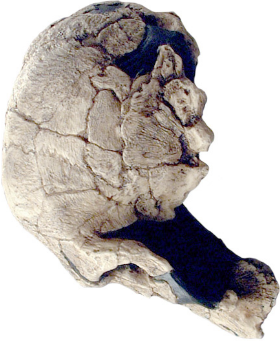
Homo rudolphensis KNM-ER-1470