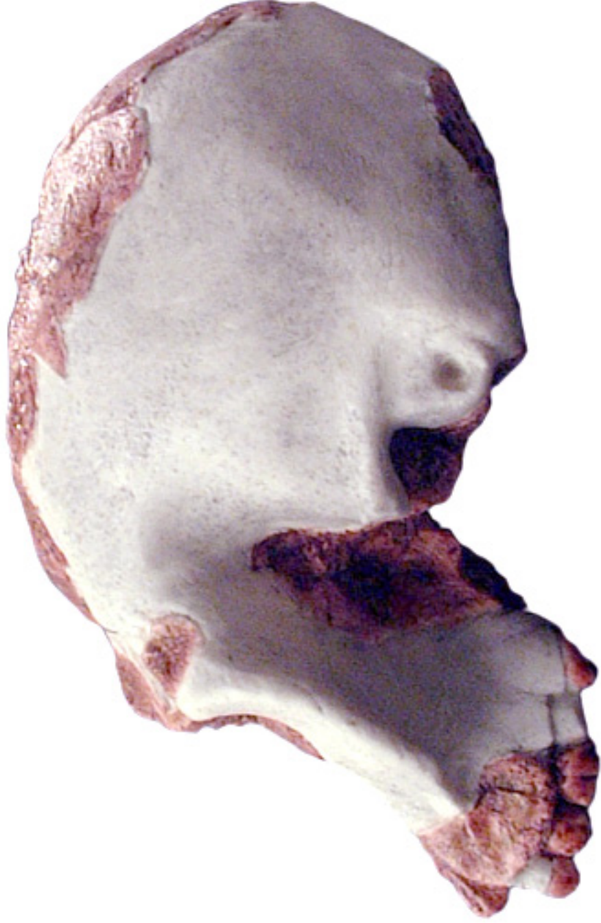
Homo habilis NMK-OH 24